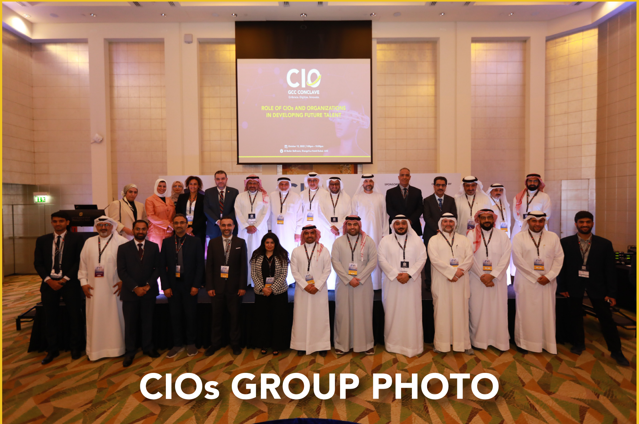
CIOs GROUP PHOTO